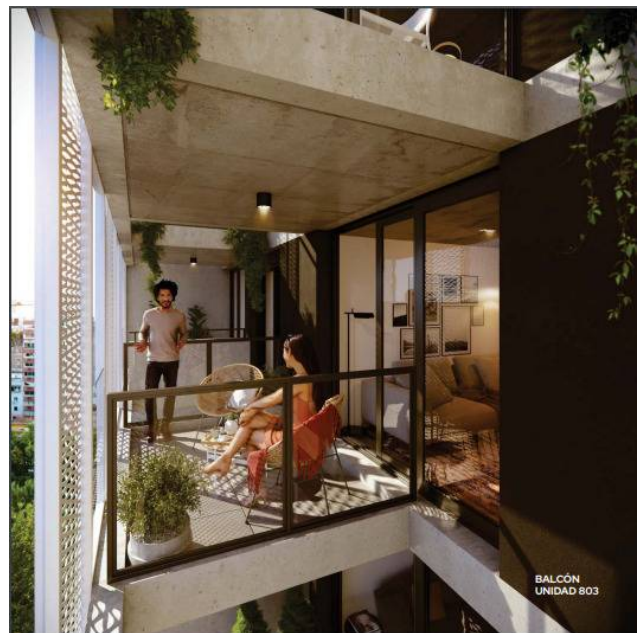
BALCÓN UNIDAD 803