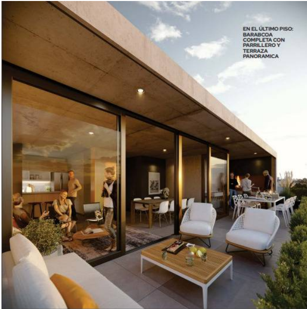
EN EL ÚLTIMO PISO: BARABCOA COMPLETA CON PARRILLERO Y TERRAZA PANORAMICA