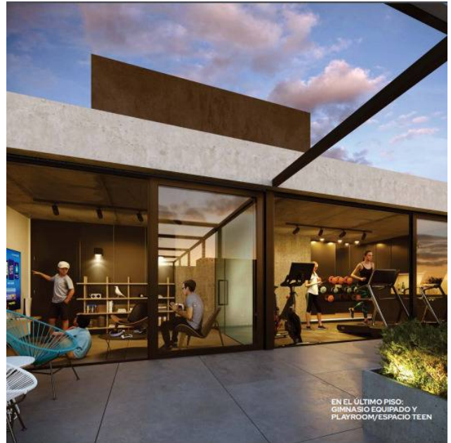
EN EL ÚLTIMO PISO: GIMNASIO EQUIPADO Y PLAYROOM/ESPACIO TEEN