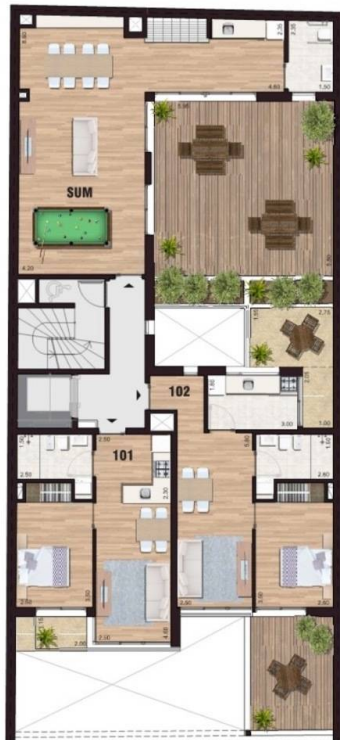
UNIDADES 1 DORMITORIO