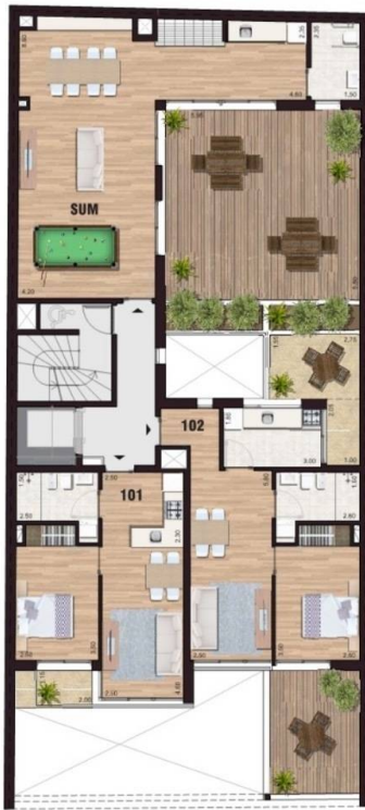
UNIDADES 1 DORMITORIO